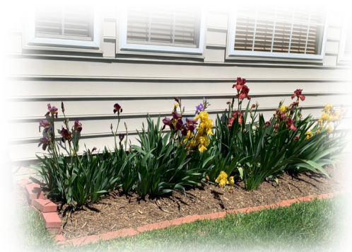
Garden of Deborah Determan