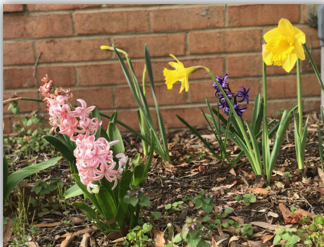
Garden of Lucille Gwynn