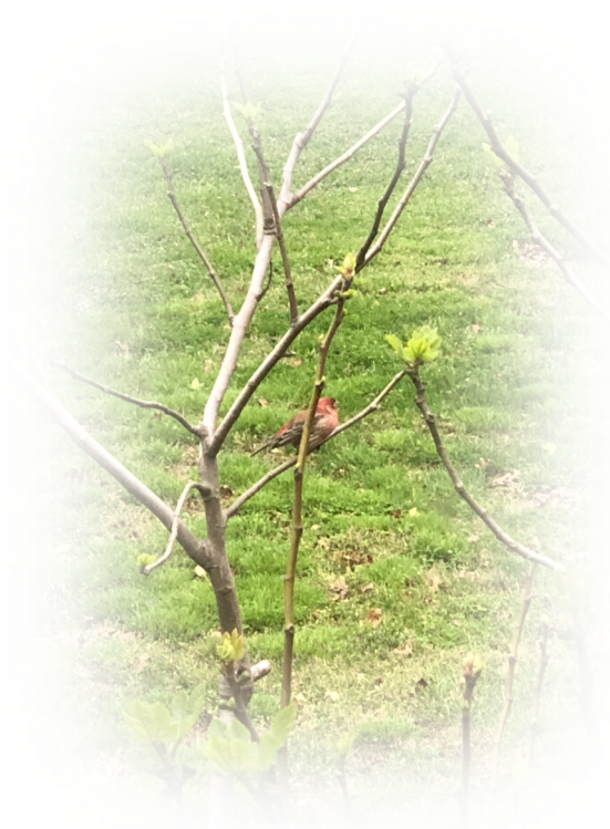
Fig Tree - Garden of Mary Beth Cecil