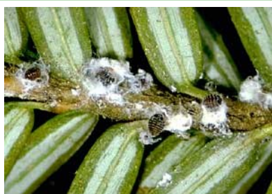
Hemlock Woolly Adelgid

Information courtesy of The Maryland Invasive Species Council (MISC) http://www.mdinvasivesp.org/invasive_species_md.html