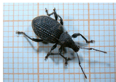
Black Vine Weevil