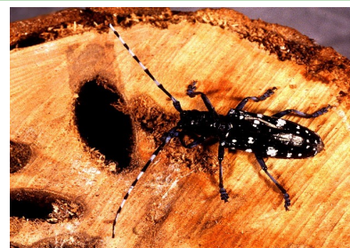
Asian Longhorned Beetle