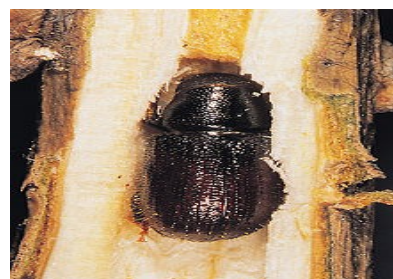
Pine Shoot Beetle