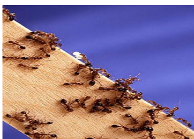
Red Imported Fire Ant